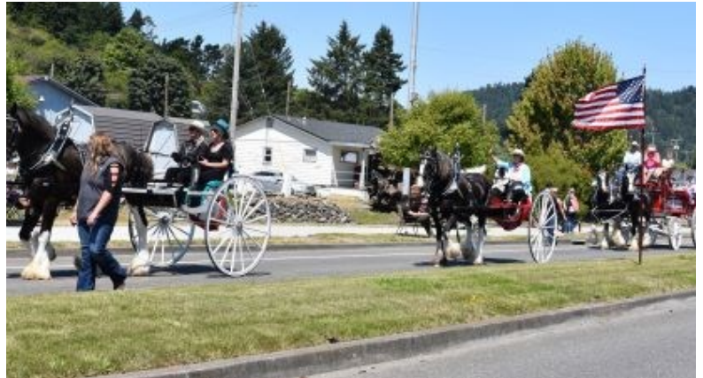
PARADE BEST OVERALL ENTRY