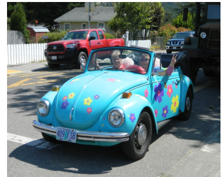
OREGON VW BUG IN PARADE