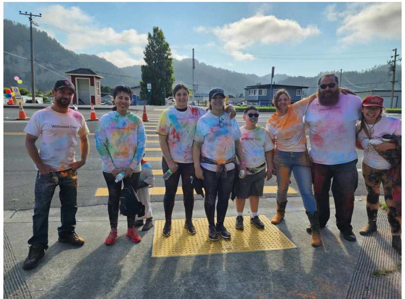
COLOR RUN WILDWOOD DAYS