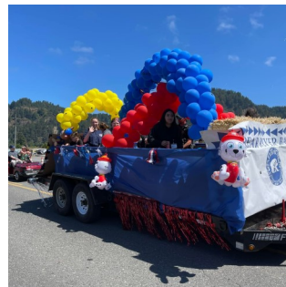
Best Overall Bear River Rancheria