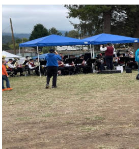
Scotia Band playing