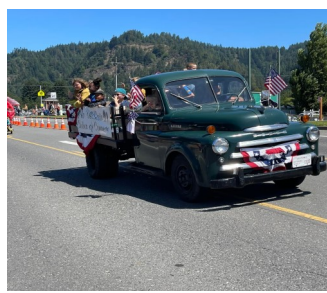
RD-S Chamber Float