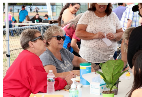
Buying a Duck?