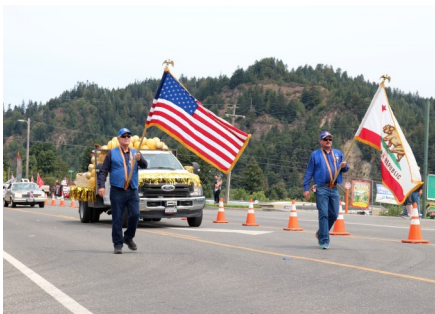
Flags on parade