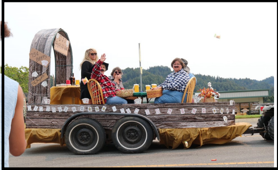
Best overall float DJ'S Burger Bar