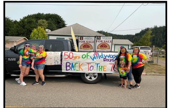
Best use of theme in parade Cornerstone Realty