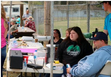
Just hangin' out!