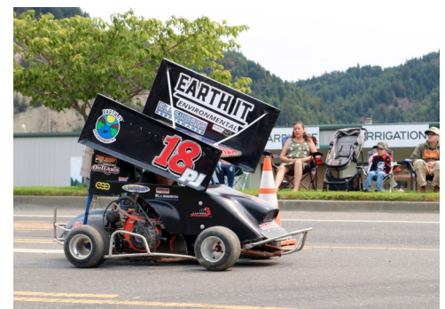
Want to go racing ?