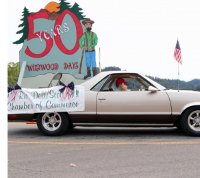
Rio Dell -Scotia Chamber float