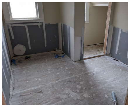
ADA Bathroom Scotia museum