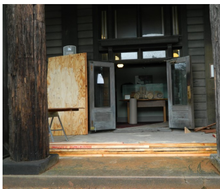
Main Entrance to Scotia Museum

The building itself was constructed in 1920. The museum opened in the early 1950s, when a new bank building, now the office of the Town of Scotia Company, was completed.