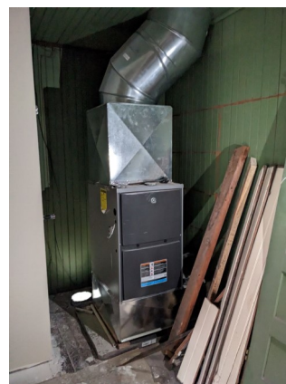
HVAC in Museum