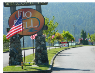
Flags on the Avenue

The flag project launched last year has seen strong support, with so many people sponsoring a U.S. flag that additional ones needed to be purchased, with school students, members of a Fortuna Cub Scout troop and their adult leaders as well as others in the community turning out to set out and take down the flags on national holidays. Now with 88 sponsored flags, the chamber will be creating locations for those additional ones purchased, in advance of the Memorial Day launch to the 2021 flag holiday season, and has another 12 flags that could still be sponsored. Contact the chamber at rdschamber@gmail.com or call 707.506.5081 with questions, or mail your check for $50 and your contact information as well as the commemorative message to be put on the plaque, to PO Box 95, Rio Dell, CA 95562.