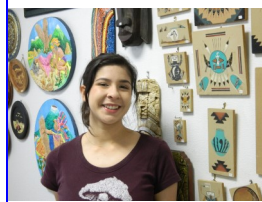
The 101 Café , just before the bridge to Scotia in Rio Dell,