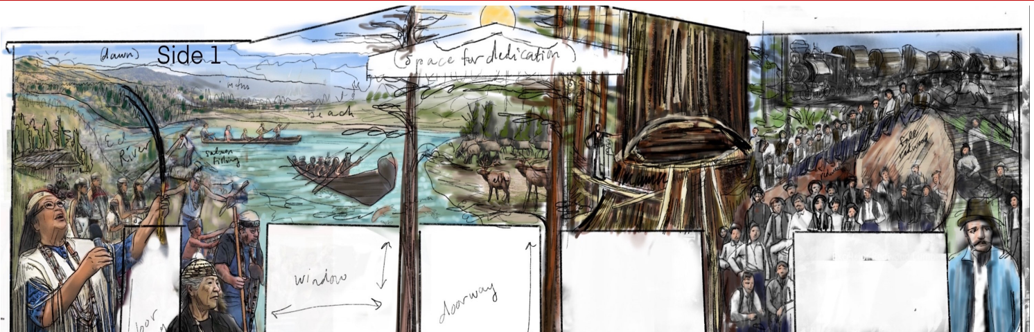
Draft of a portion of the mural