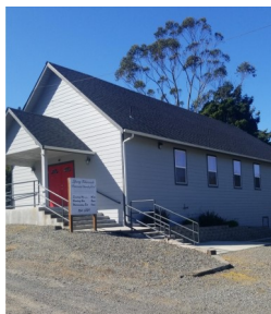
Liberty Tabernacle Church