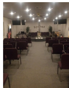
Liberty Tabernacle Church Inside View