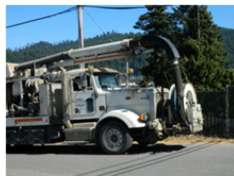
Workers and equipment from the contractor Wahlund Construction can be found around town as the drinking water replacement system is installed.

Rio Dell - Scotia News is free of charge, published monthly by the Rio Dell - Scotia Chamber of Commerce and the Rio Dell Community Resource Center. Funded by local businesses and the St. Joseph Hospital Health System. Copies distributed in Fortuna, Rio Dell, and Scotia and archived at riodellscotiachamber.org