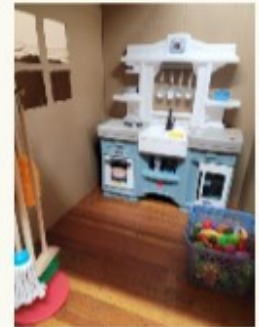
Playgroup cardboard house & kitchen