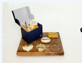
Gratitude Gift Co.