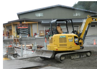
Work continues On the Scotia Gym Dec. 2023.

A separate effort (see next month’s feature) is being sponsored by several Rotary Clubs within the county to replace outdated and worn equipment at the elementary school. You can help move this effort forward by attending the Fortuna Sunrise Rotary’s annual seafood boil fundraiser taking place at River Lodge in Fortuna January 25.