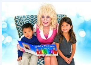
Dolly Parton & under 5 Childrens Book program