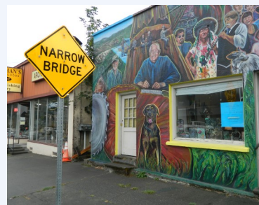
Narrow Bridge Gallery