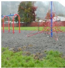
New Rio Dell Middle School Playground Equipment