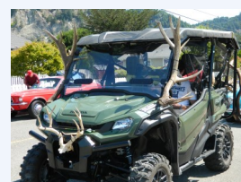
Best of Theme Parade Winner